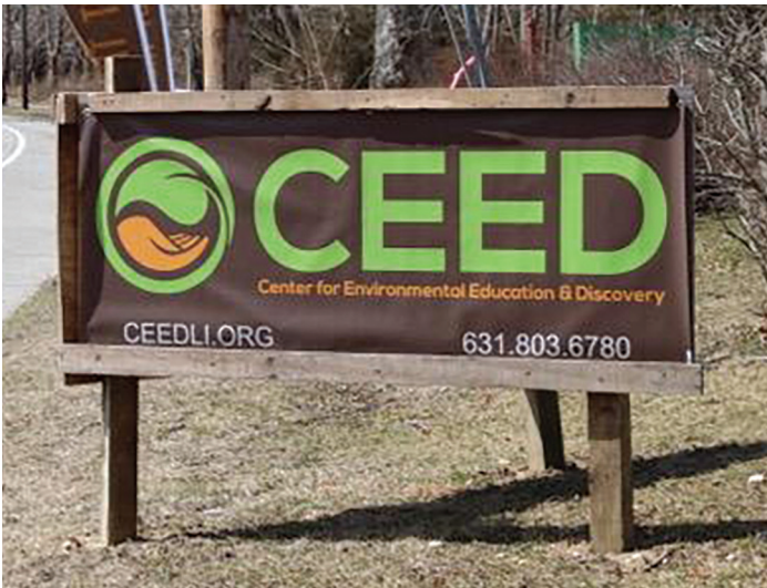
Sign on South Country Road in front of CEED at the Washington Lodge estate.

Not long ago, the town of Brookhaven turned over the keys of the historic Washington Lodge on South Country Road (former Marist Brother's estate and Bay Community School) to a new non-profit nature organization: the Center for Environmental Education and Discovery (CEED, pronounced SEED) . CEED is serving as steward of nearly 60 acres of forested town and county land that stretches all the way to the bay, using this resource to inspire reconnection to the joys of nature through environmental education, culture and the arts. CEED's vision is to foster healthier lives, healthier community and conservation of our precious natural lands.