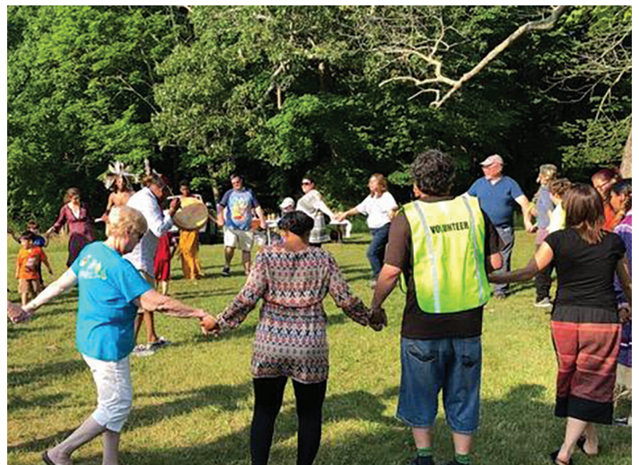
Traditional drum circle ceremony led by members of the Shinnecock Tribe at last year's Summer Solstice Festival.

CEED is also collaborating with other local organizations like Friends of Bellport Bay (FoBB) on initiatives such as the Green Lawn Project: CEED & Soil Sale, which offers organic, eco-friendly lawn and garden products and non-GMO birdseed twice a year, as an alternative to synthetic fertilizers that lead to toxic nitrogen run off into the bay. And this July, Post-Morrow Foundation will host CEED's first summer program for kid's at Post-Morrow's preserve on Bay Road. The CEED Summer Nature Experience will offer a hands-on, nature exploration experience for your children or grandchildren entering grades 2-6. Immersed in the outdoors, children will participate in creek seining, catching marsh critters, forest and field exploring, science experiments, live animal encounters, nature crafts and