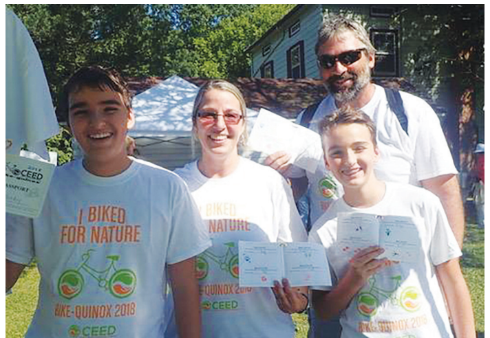
Local families "Biked for Nature" at last year's Fall Bike-quinox Festival, raising funds for CEED by participating in a bike scavenger hunt.