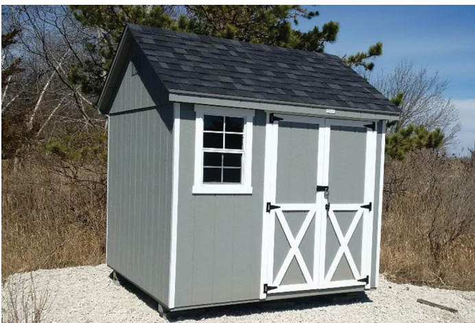
The new iceeater storage shed.

There is also a lot of infrastructure work being done to the marina to further improve it, including electrical and water upgrades. This work will add to the experience of boating at Squassux.