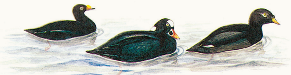
Common, Surf, and White-winged Scoters (left to right)

Brookhaven Hamlet Foundation, PO Box 387, Brookhaven, NY 11719