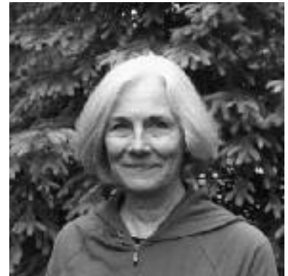
Mary "The feeling of country with no streetlights or sidewalks"