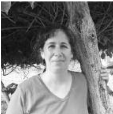
Peg "The beautiful wetland, Carmen river and HOG farm!"