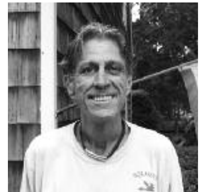
Kevin "Rural, low-key character, natural diversity - marshes, rivers, bays, estuaries"